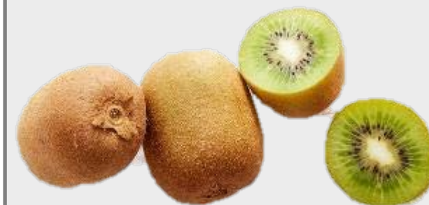
Varietal Group C Megakiwi