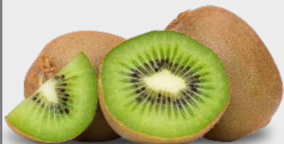
Varietal Group A Haywards