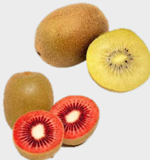
Varietal Group B A. Chinensis